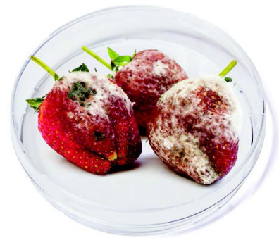
INDICATIVE OF UNTREATED AND STORED FOR 6 WEEKS AT 4°C

Jaymak operates under a fully Integrated Management System (ISO 9001, ISO 14001, ISO 22000 & ISO 45001) for the provision of planning, coordination and specialised cleaning services to the hospitality, healthcare, and food sectors.