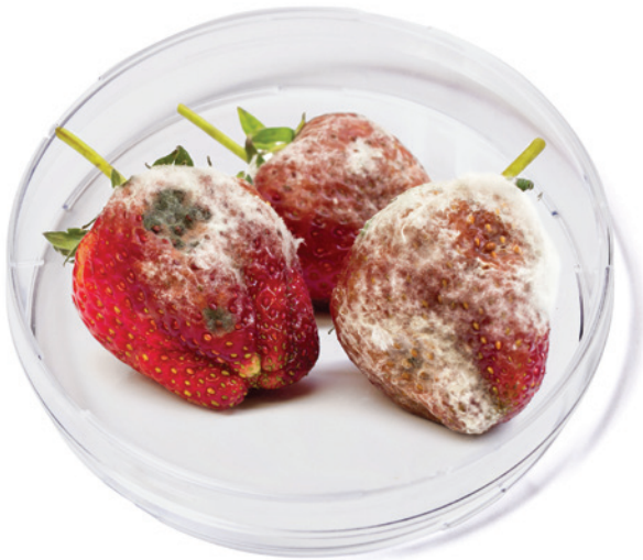
Indicative of untreated and stored for 6 weeks at 4°C

Recent trials in hotel restaurant coolrooms have proven extremely successful especially with berries and herbs having extended shelf life and maintaining their freshness for longer.